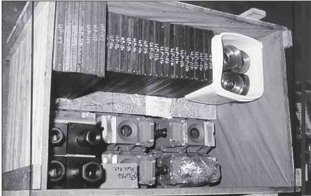
Packaging comes complete with part identification.

Proper packaging is an integral part of our policy to assure our customers will receive quality kits, with part identification. No expense is spared to supply the very best materials and workmanship on this phase of our business. UNISORB customers have been very pleased with our packaging procedures.