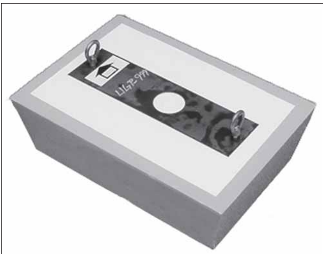
UNISORB Grout Pocket Forms are unique.

Our grout pocket forms are unique, and make placing grout pockets simple. The form is simply slid over the anchor bolt and secured with the top of the form even with the top of the foundation. After the foundation is poured and stripped, the form is simply removed from the concrete by pulling up on the eye nuts supplied with it. Your grout pocket is now ready for use.