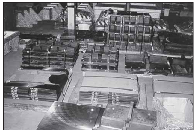
A large inventory of parts and kits are in stock.