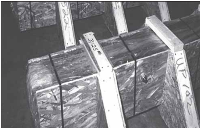
Only top quality goes into UNISORB packaging.

UNISORB has scores of satisfied customers who have taken advantage of our superior products and services over the years. Please consult with UNISORB's Power Generation Engineering Department for a list of these references.