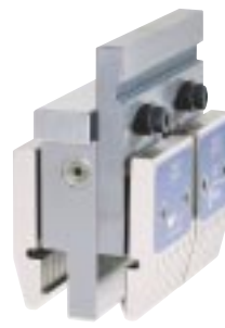
Amada® Z1 and most European (Promecam®) Style Press Brakes