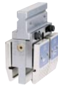
Trumpf® Press Brakes