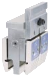
Amada® Z2 Style Press Brakes