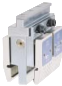
American Press Brakes